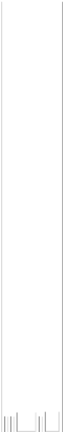
Evaluation Systems group of Pearson All program completers, 2014-15