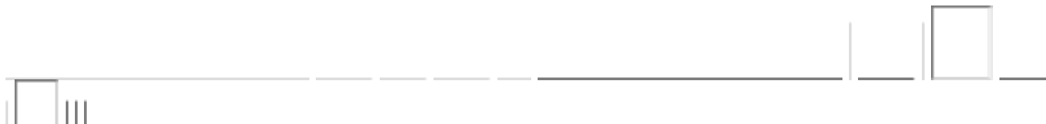
NT601-SPECIAL EDUCATION Evaluation Systems group of Pearson All program completers, 2012-13