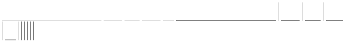
NT601-SPECIAL EDUCATION Evaluation Systems group of Pearson All program completers, 2013-14